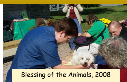
Blessing of the Animals, 2008