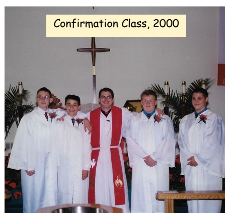
Confirmation Class, 2000