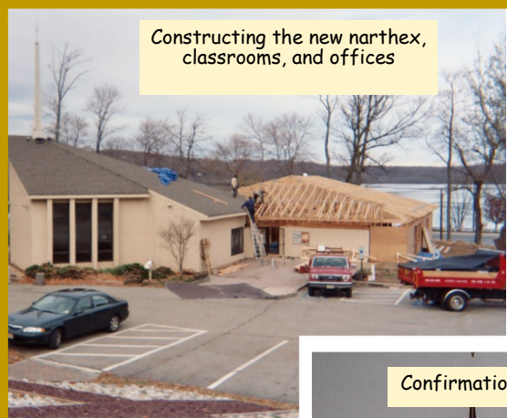
Constructing the new narthex, classrooms, and offices