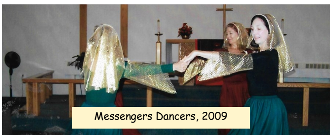
Messengers Dancers, 2009