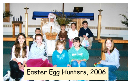
Easter Egg Hunters, 2006