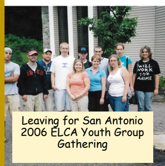
Leaving for San Antonio 2006 ELCA Youth Group Gathering