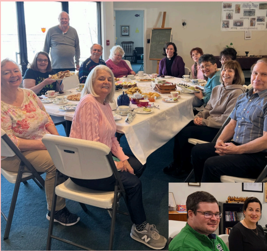
All smiles at the Senior Ministry Tea Party and Annual Chili Cook-Off!