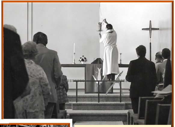
First service in our sanctuary on Pentecost, May 14, 1978, one year after groundbreaking.