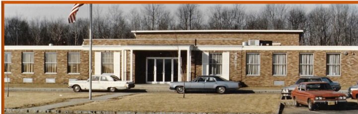
Services were held in the cafeteria and various other spaces in the Upper Elementary School (now the Chester M. Stephens School).