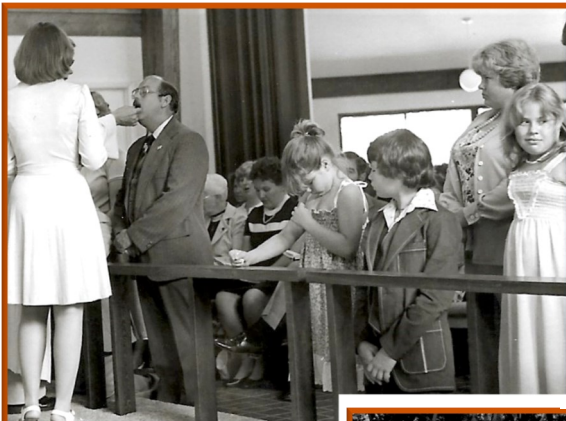
First service with communion in our new building.